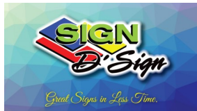
6 Years Tournament Sponsor