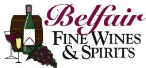
6 Year Tournament Sponsor

"Proudly serving and satisfying the Lowcountry and beyond since 1986"